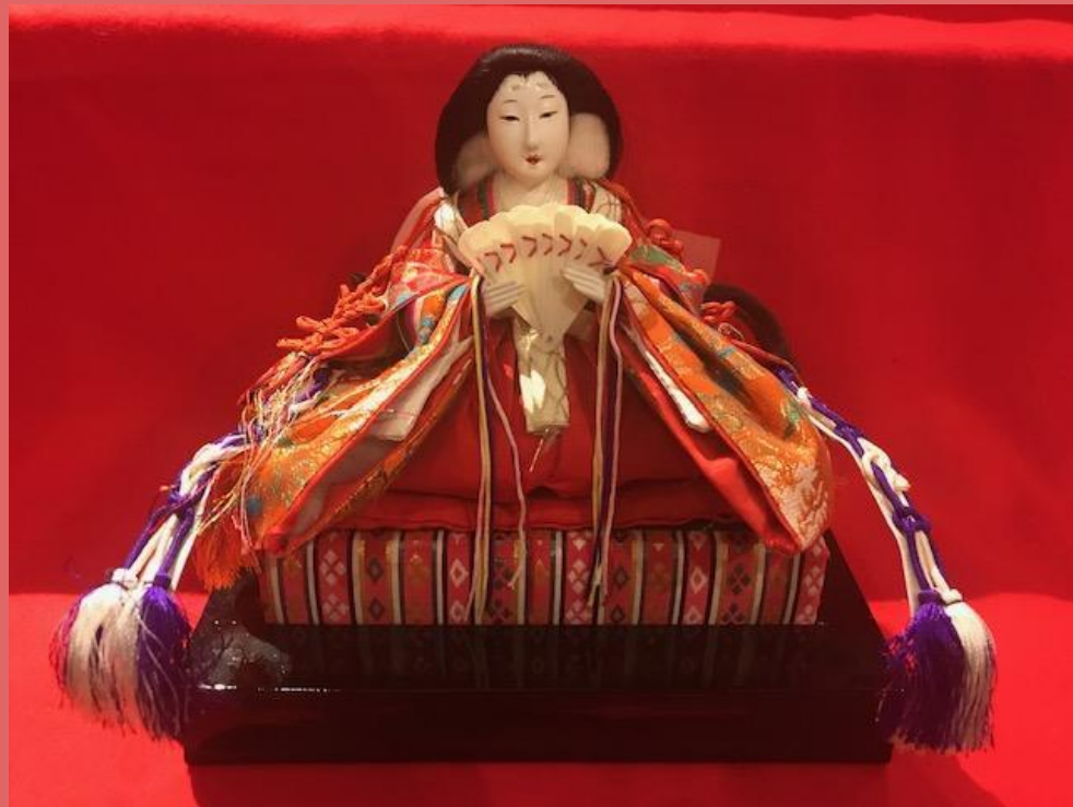
Hina Ningyo Dolls