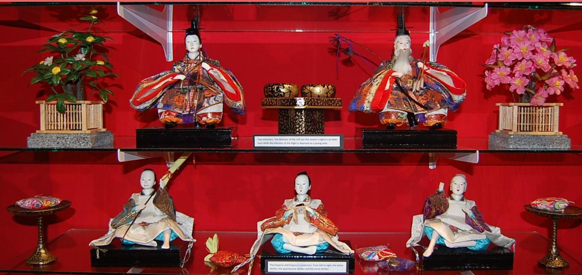
Hina Ningyo Dolls