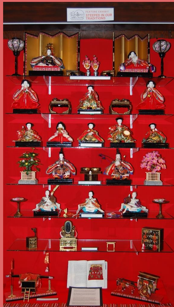
Hina Ningyo Dolls