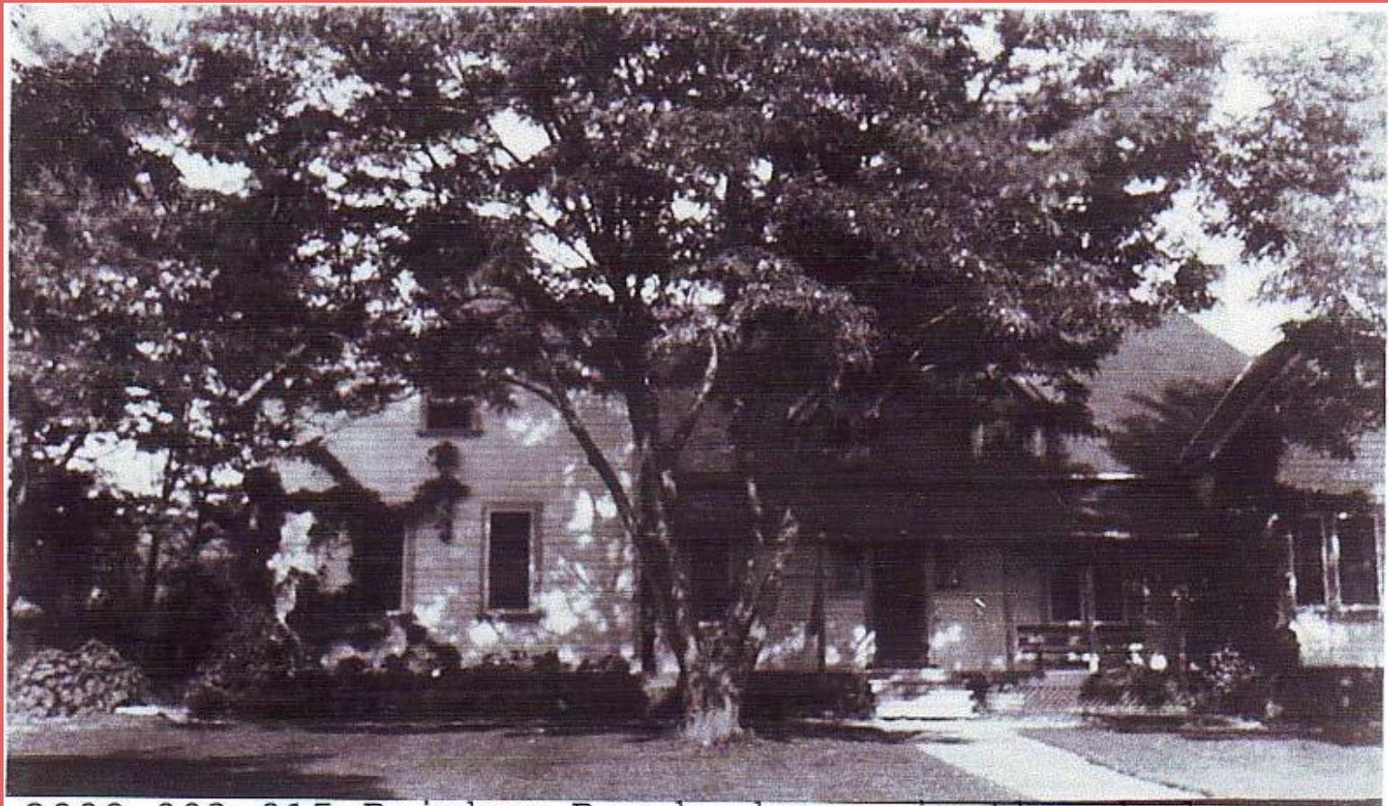
2009.003.015 Rainbow Ranch house in the shade