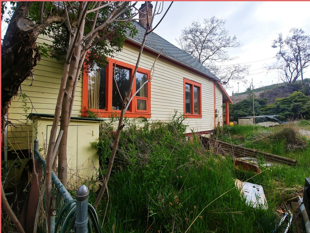
Rainbow Ranche As it is today