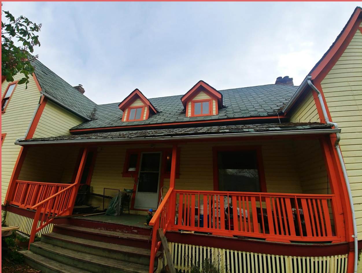
Rainbow Ranche As it is today