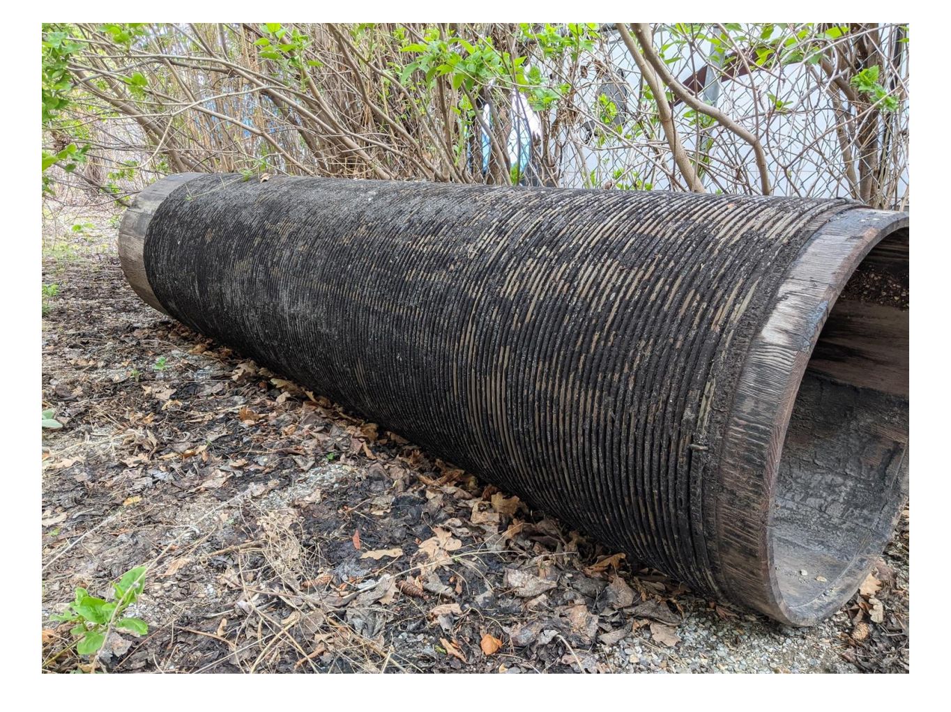
Irrigation pipe as it is today