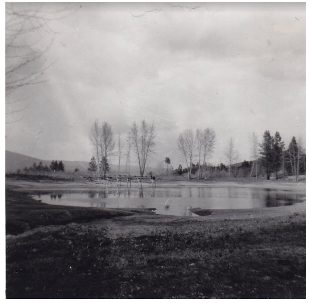
Seaton Park. This was a holding ground for domestic and irrigation water.