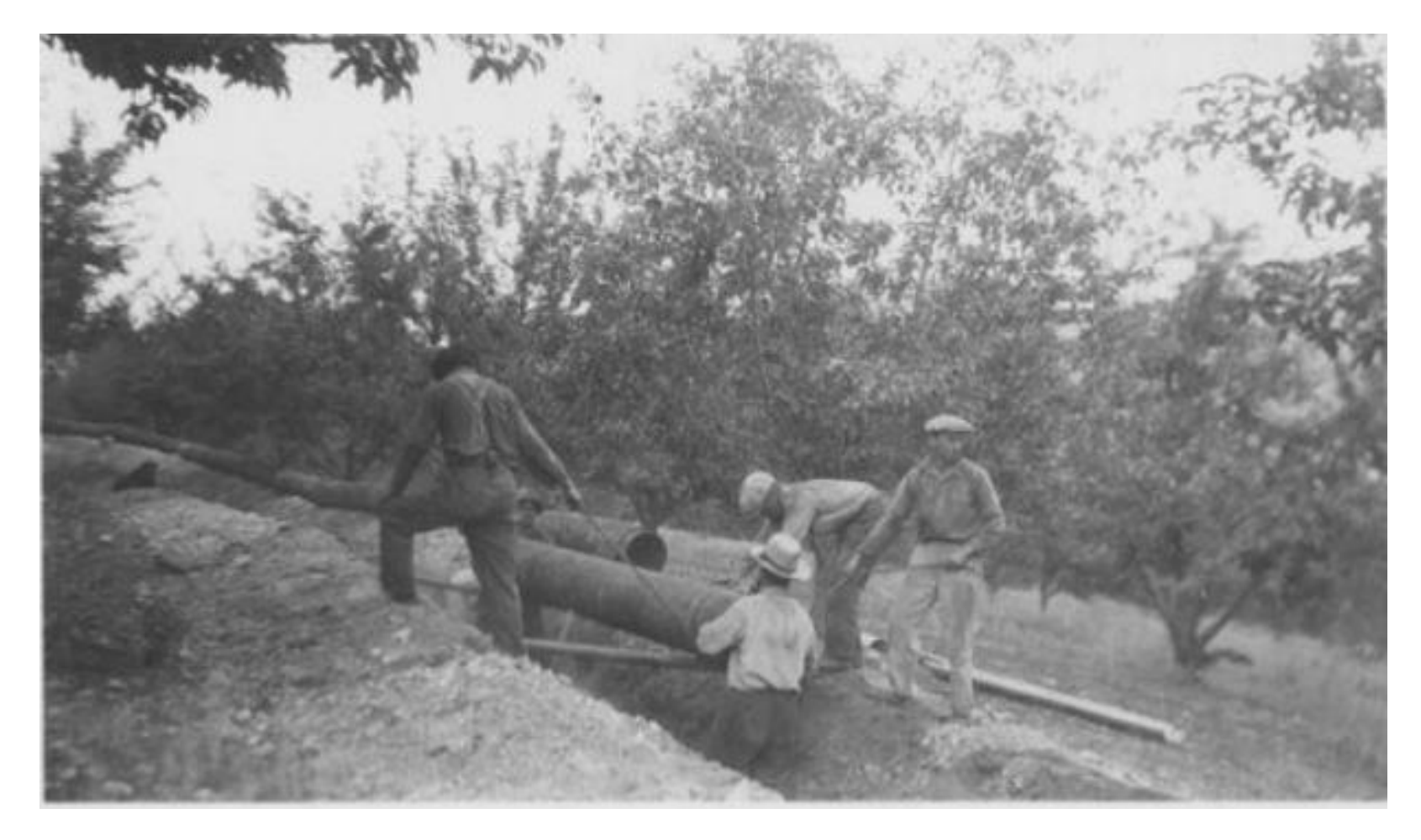
Men working on irrigation lines