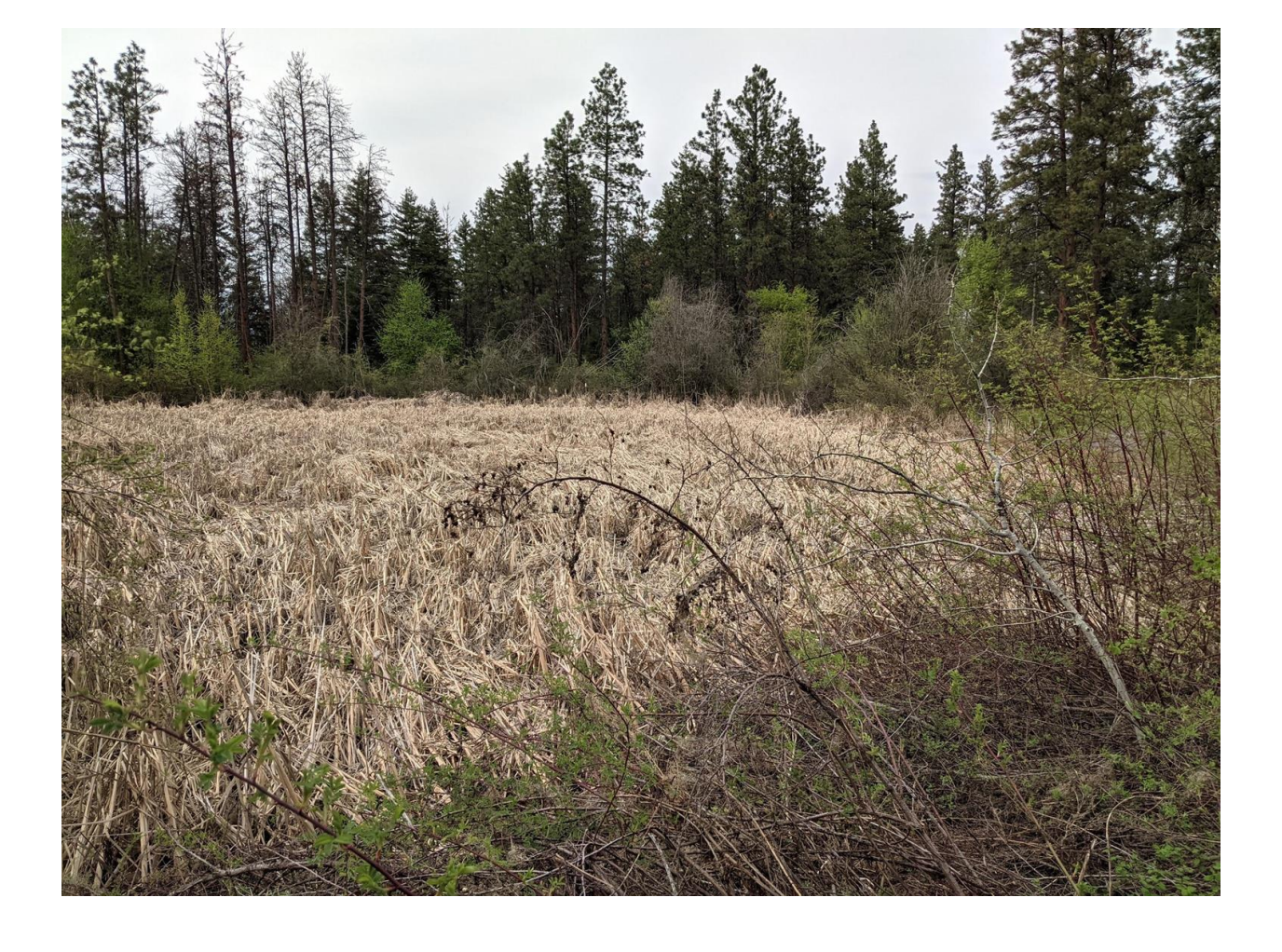
Seaton Park as it is today.