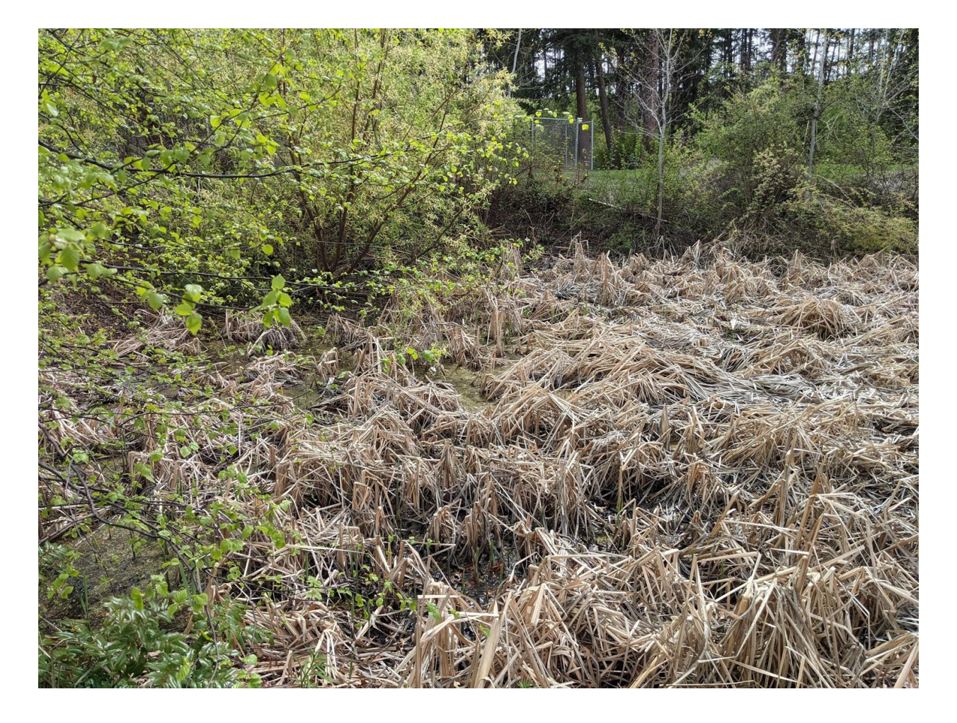
Seaton Park as it is today.