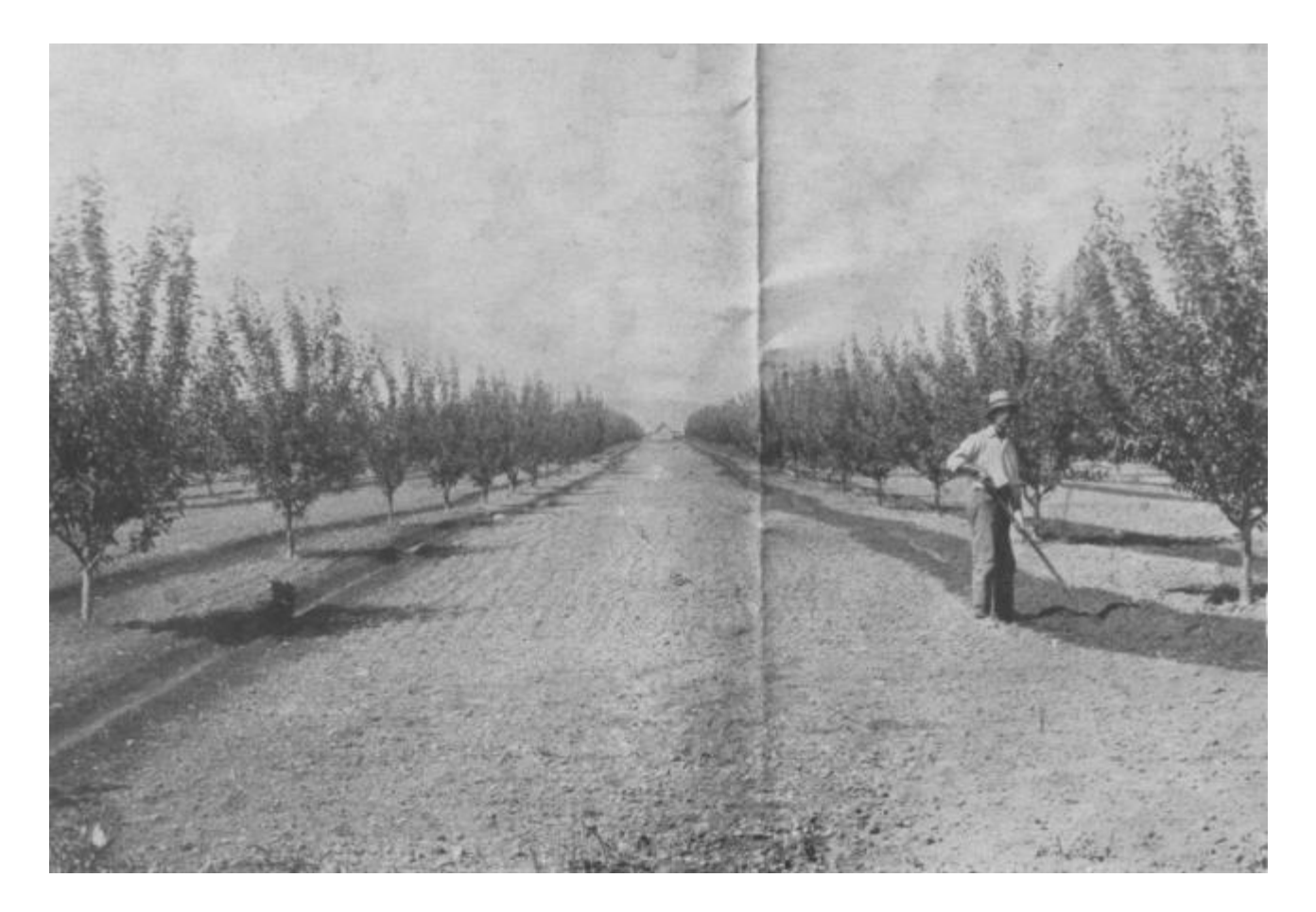
Man standing in an orchard beside irrigation channel