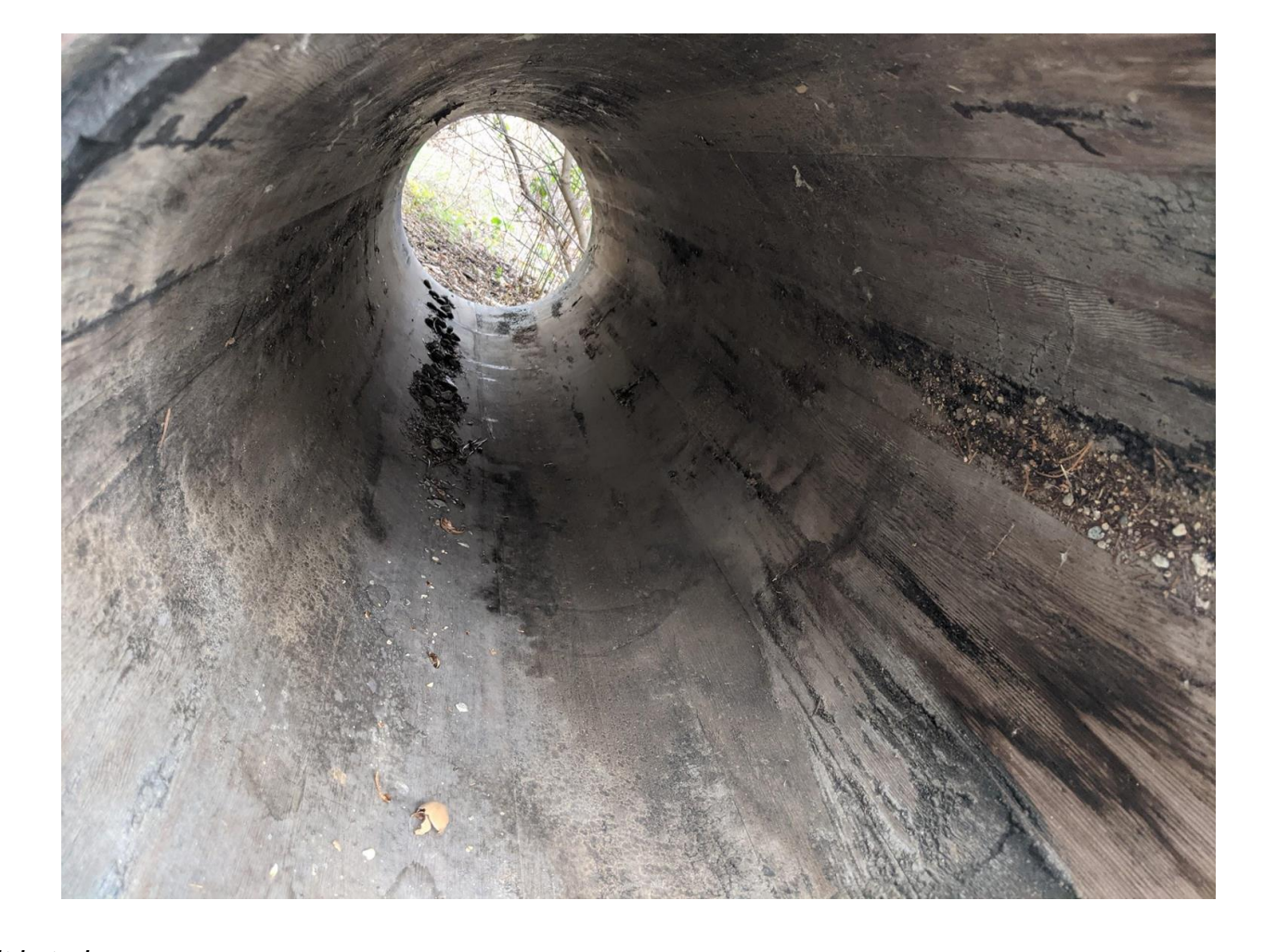
Irrigation pipe as it is today