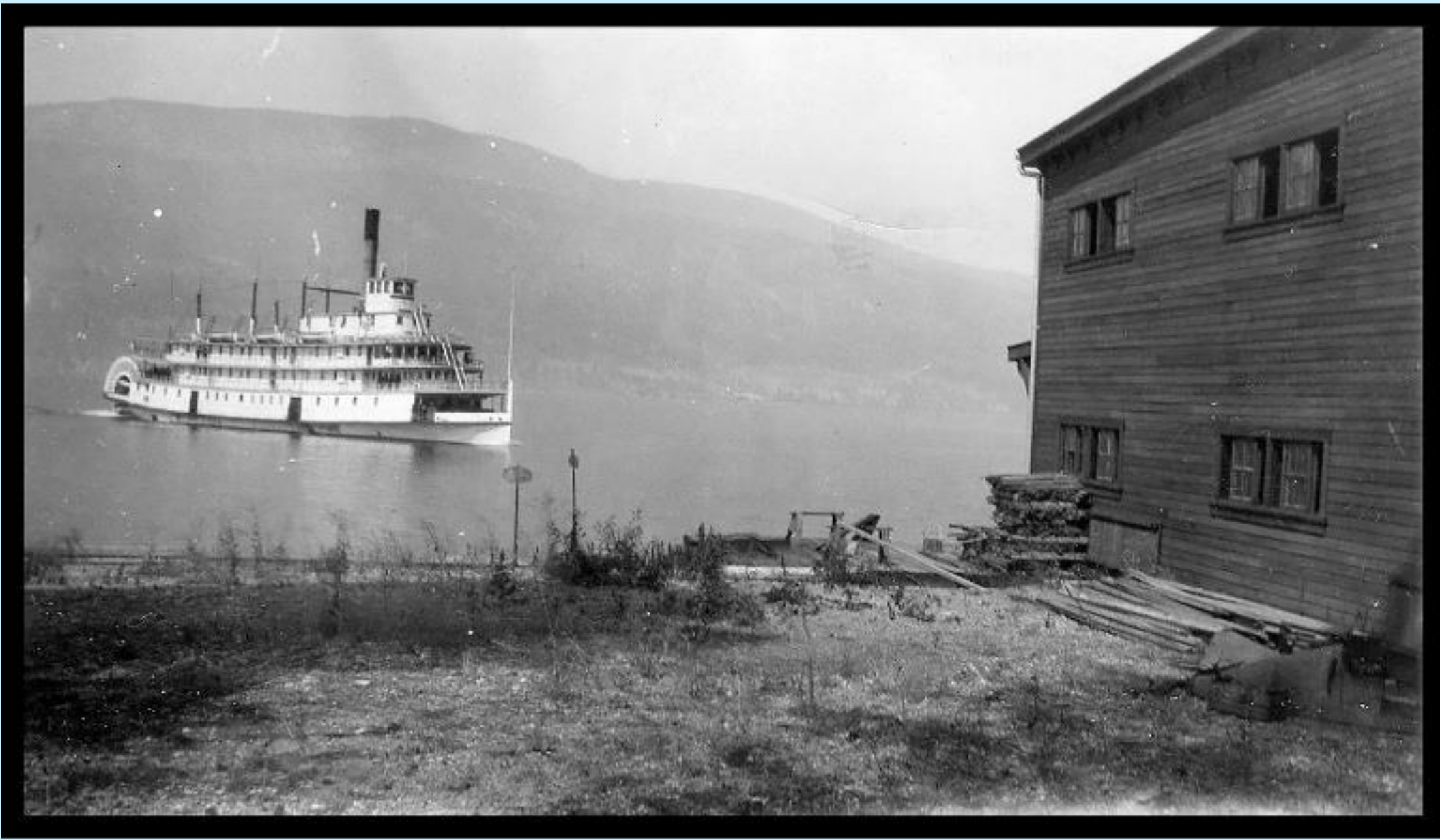
S.S. Sicamous off Okanagan Centre 2007.021.001 LCMA