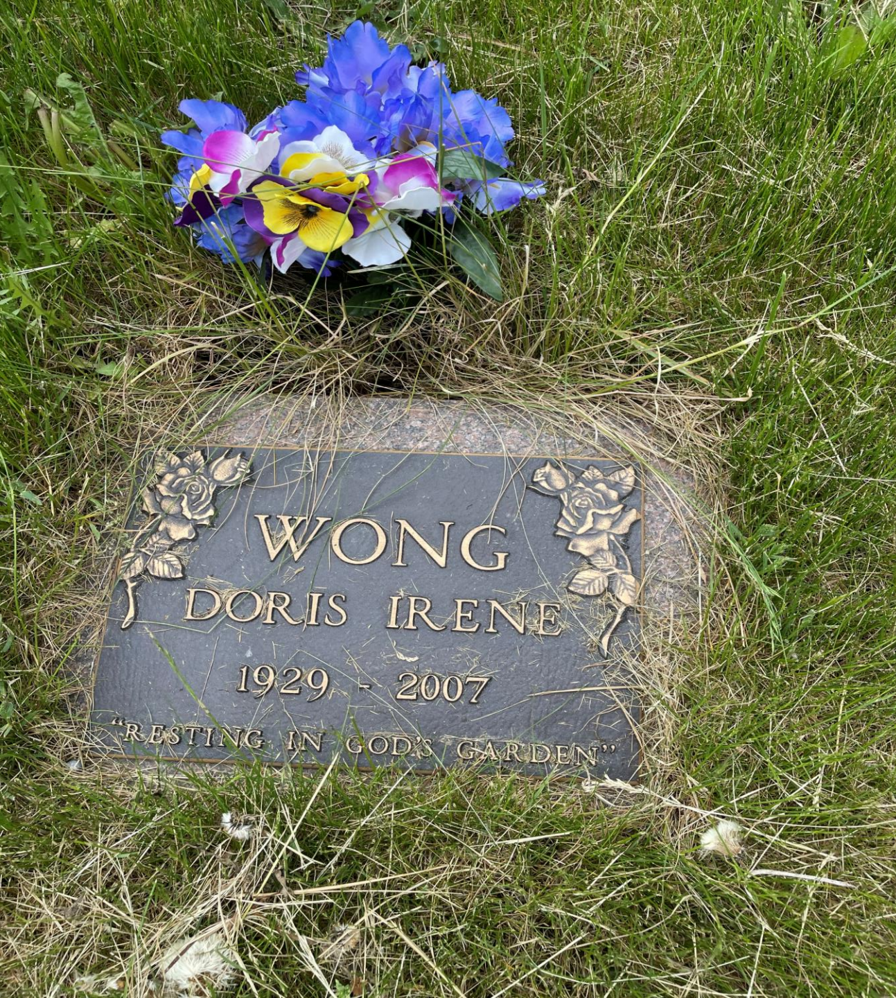
Cemetery Headstone of Doris Wong at Oyama Community Cemetery, 2024