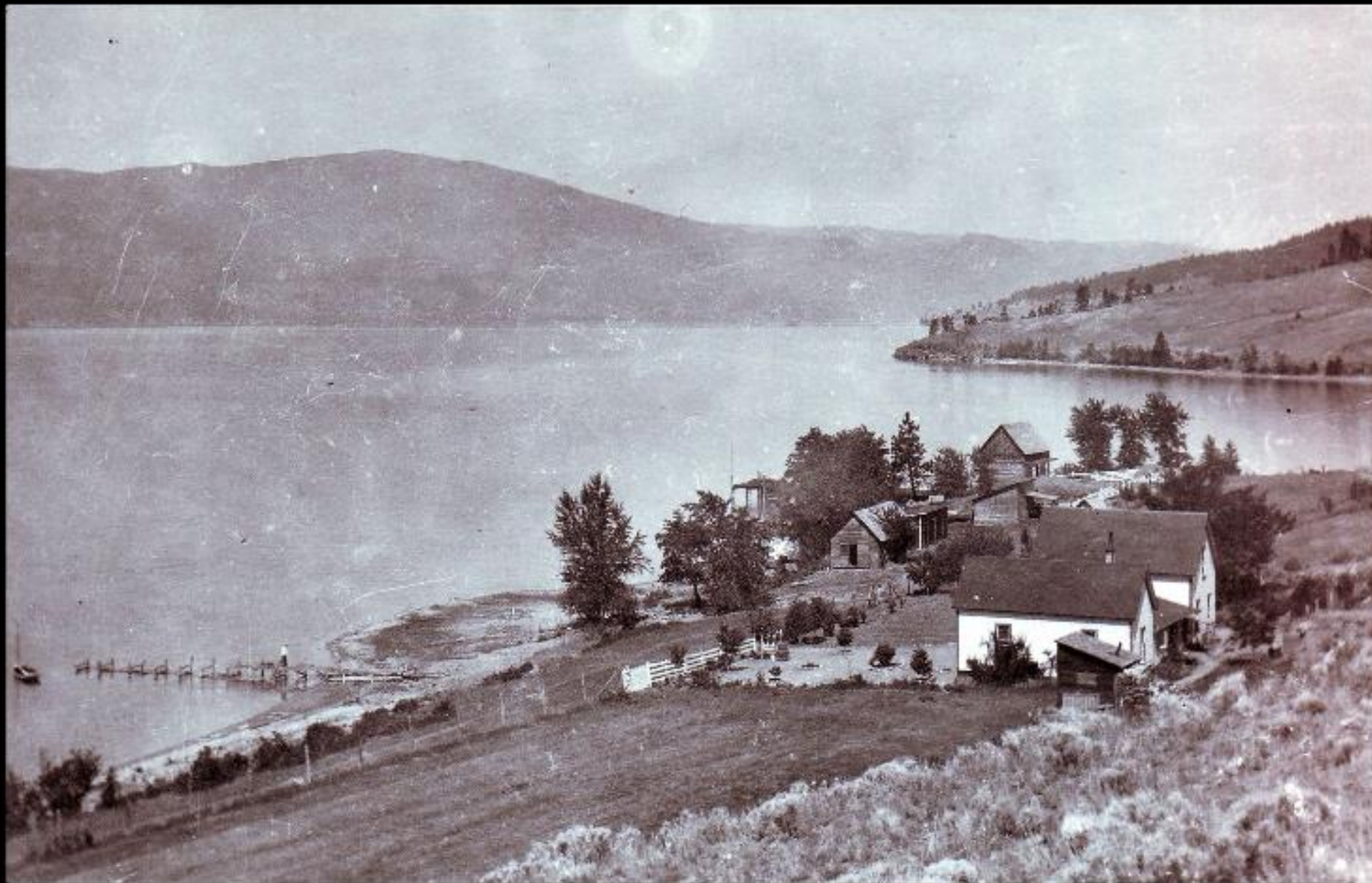
Rainbow Ranch House and Okanagan Lake 2013.57.1.01.19 LCMA