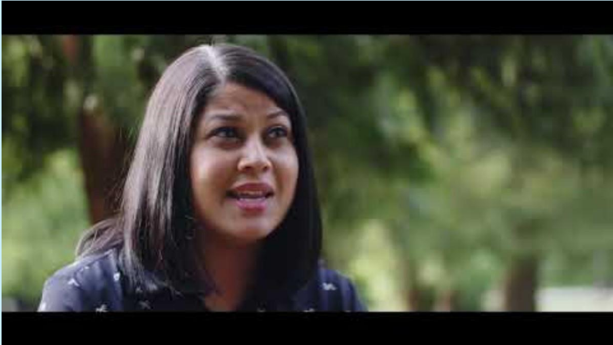
“Remembering Komagata Maru,” YouTube , City of Vancouver, 2021