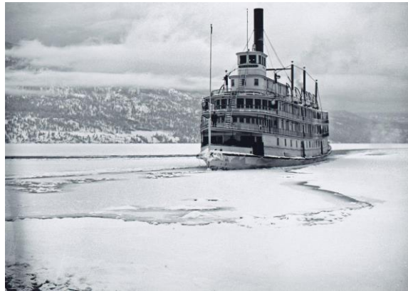
SS Sicamous travelling between the ice on Okanagan Lake, Winter.

Other luxury-class sternwheelers carrying fruit, produce, dry goods, and passengers were the CPR's SS Aberdeen and the SS Okanagan. Smaller boats, such as the SS Naramata, provided passenger service to other settlements around the lake.