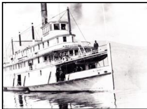
SS Okanagan on Okanagan Lake. This ship was built at Okanagan Landing in 1907. (LCMA)

At this time, the roads were very bad, and the closest rail connection was at Okanagan Landing. The townsfolk, farmers and ranchers used these charming ships as their main means of travel. They went on special excursions and moonlight dance cruises, picnics, regattas, and farm fairs. To the settlers homesteading on the side of a hill, watching the boat coming round the point was a highlight of their daily lives. It meant mail, supplies and perhaps a chance to visit with friends and neighbours on the wharf. As one old-timer put it, it made them feel far less isolated. For many, a round trip was the only vacation they could afford.