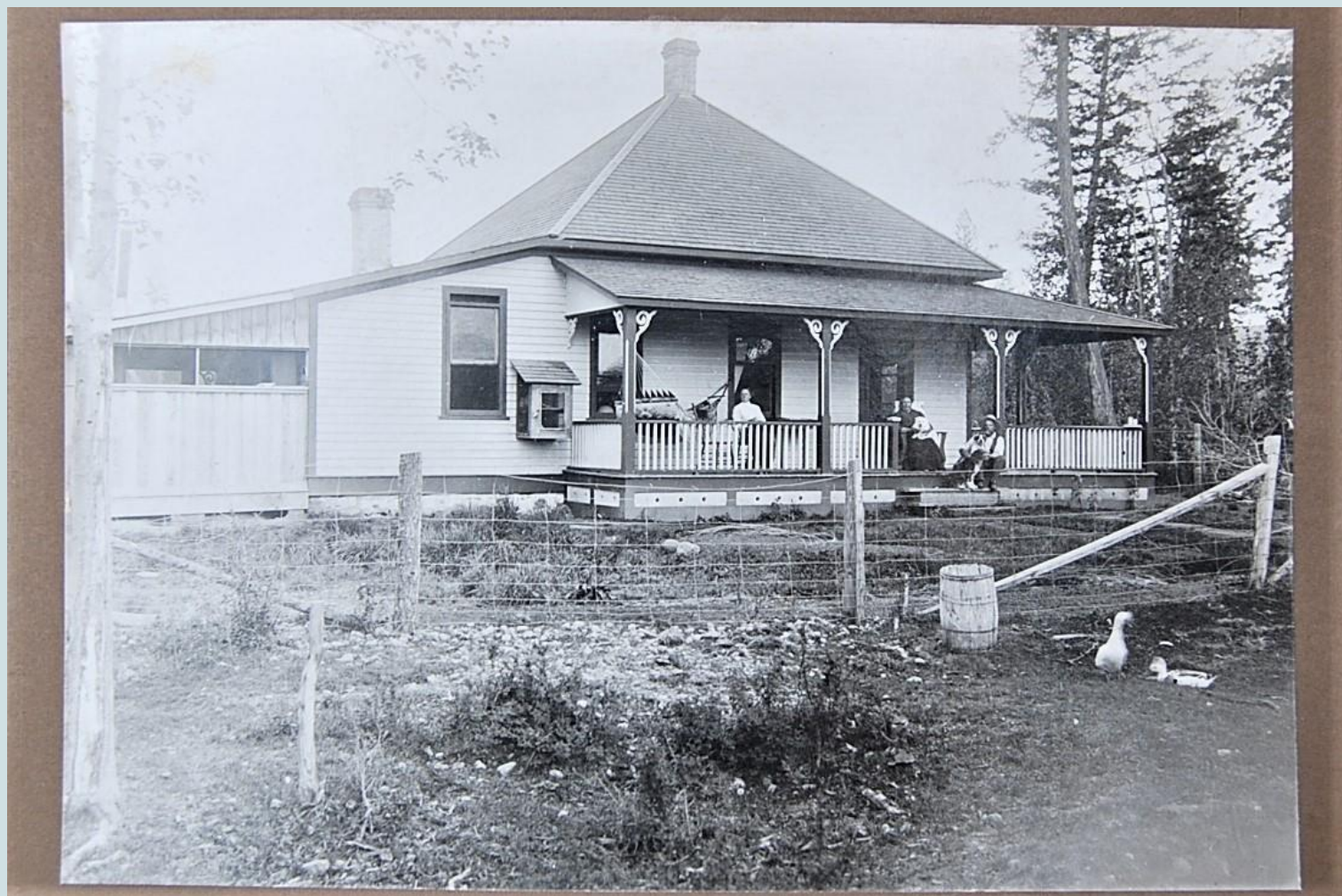
The house that Jane built, where Swallwell Park is