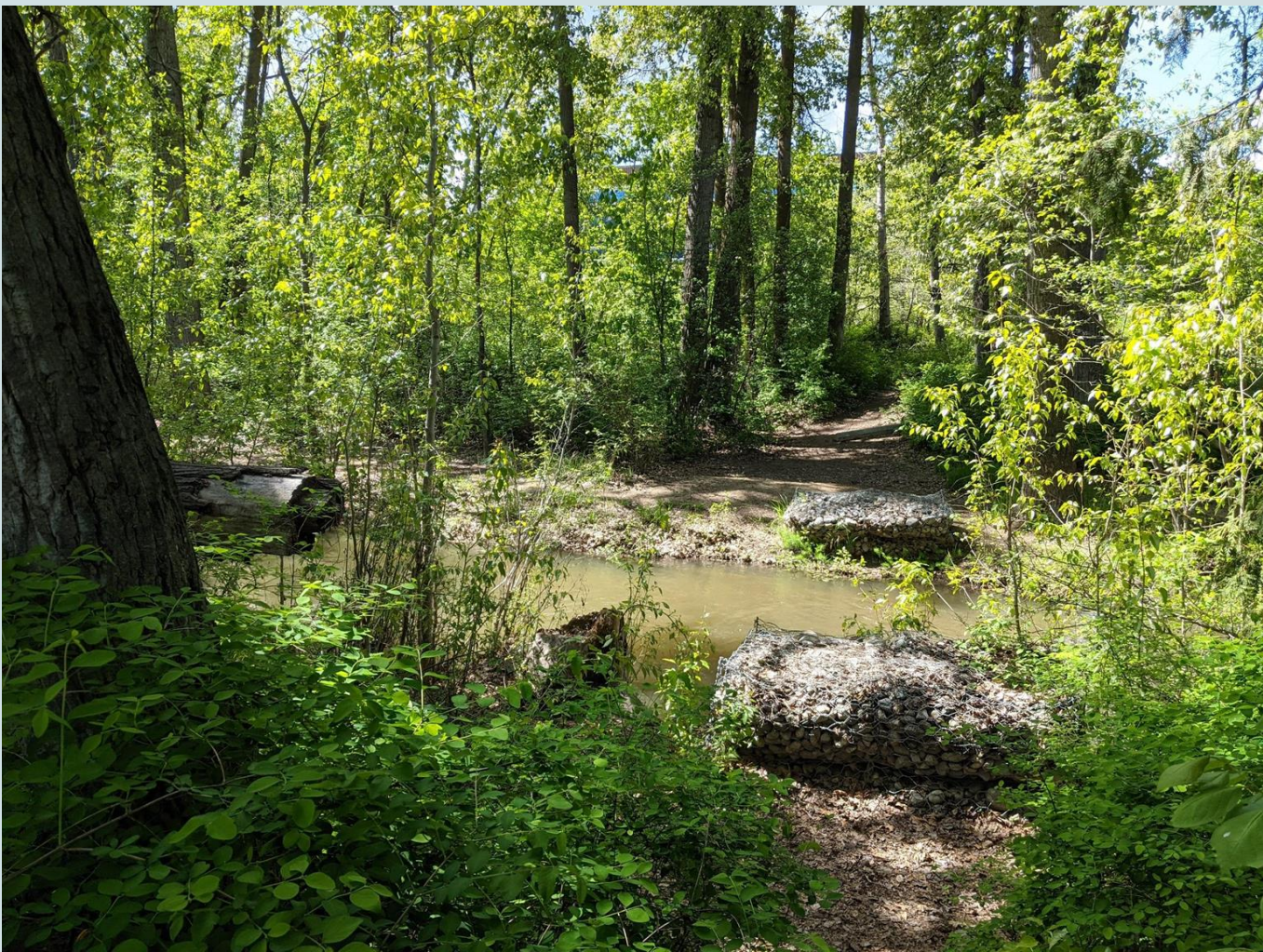
Swallwell Park as it is now