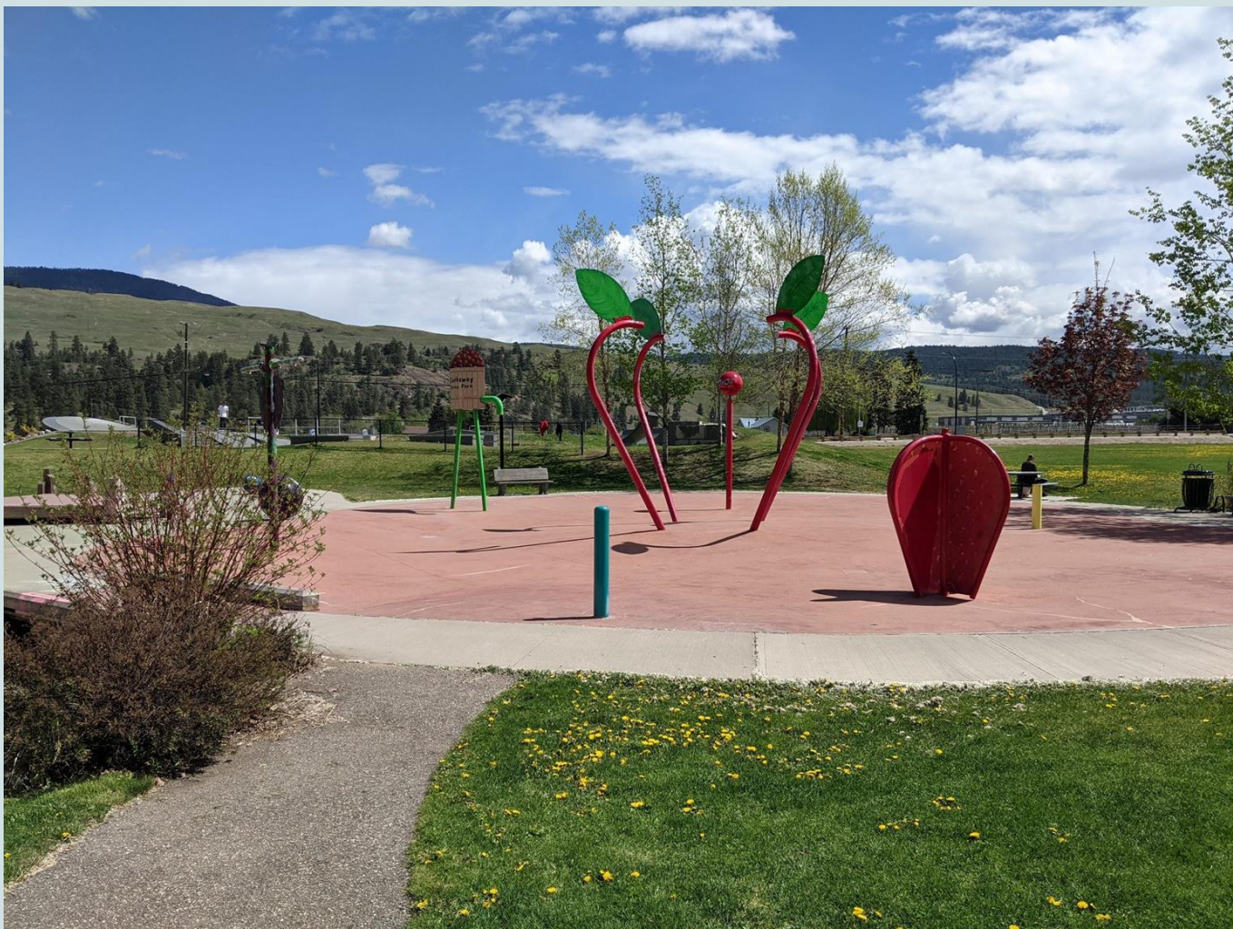
Swallwell Park as it is now