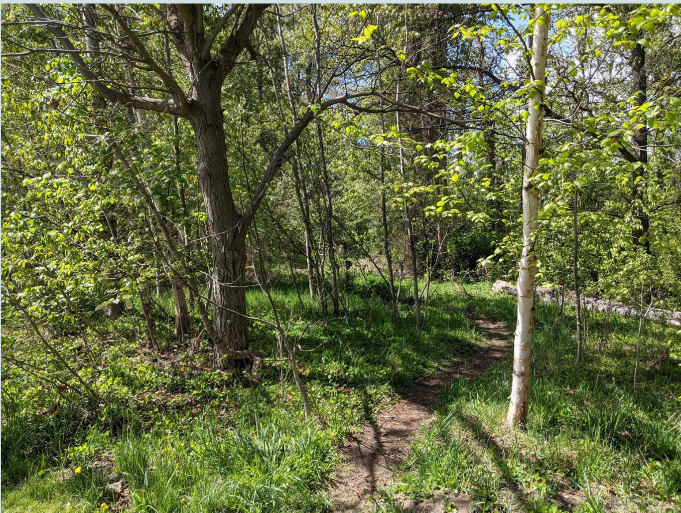
Swallwell Park as it is now