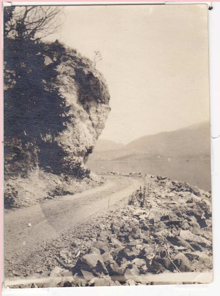
Hwy 97 along Woods Lake north, 1914