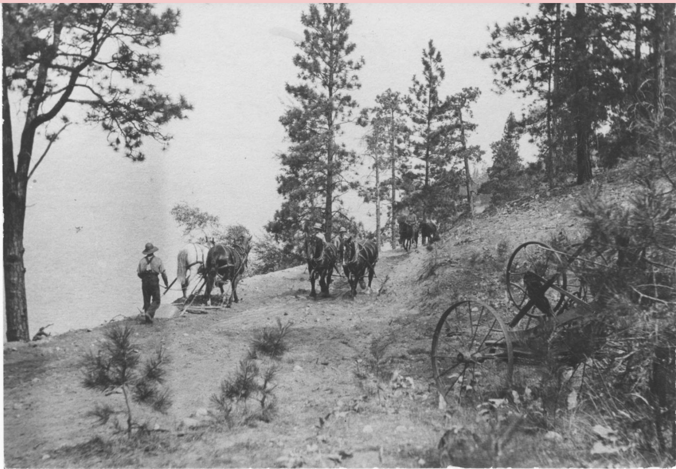
2007.019.005 Road Building 2