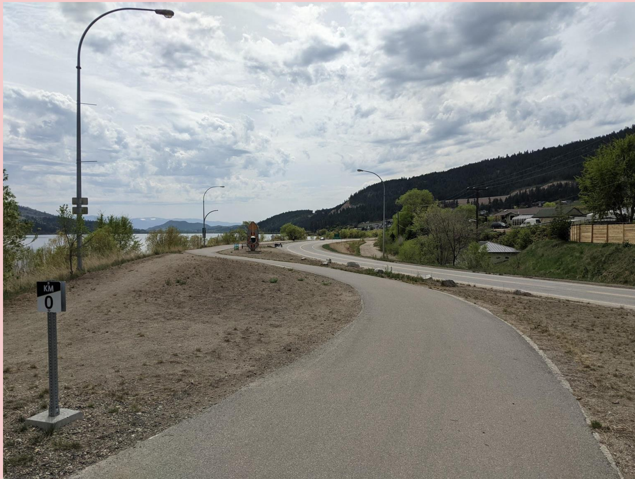
Stagecoach Road as it is today (Railtrail Pelmewash Parkway)