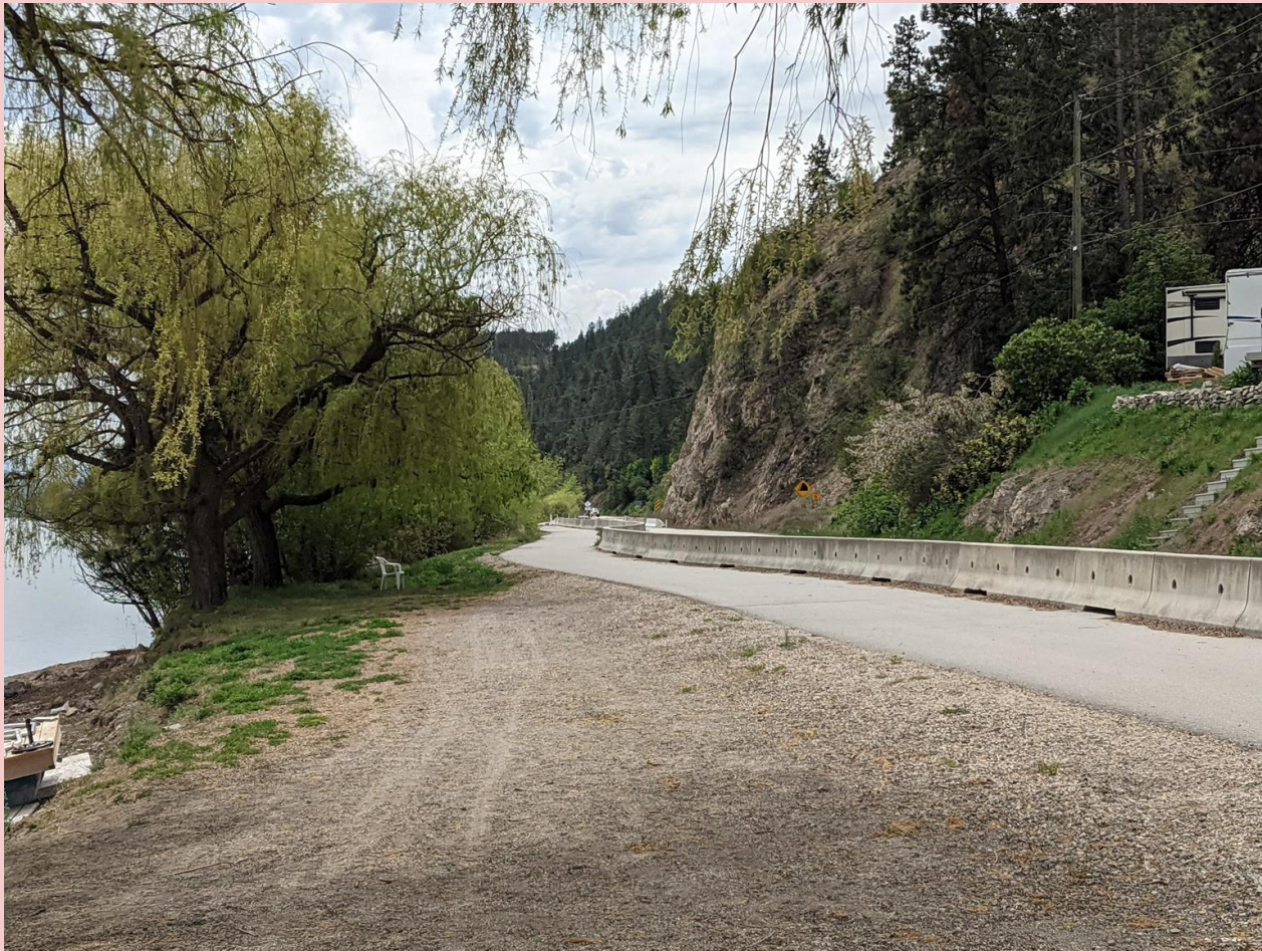
Stagecoach Road as it is today (Railtrail Pelmewash Parkway)