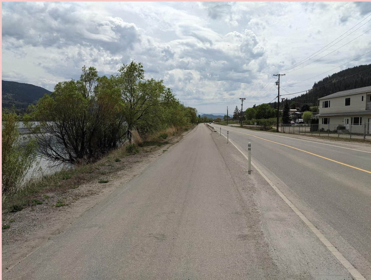
Stagecoach Road as it is today (Railtrail Pelmewash Parkway)