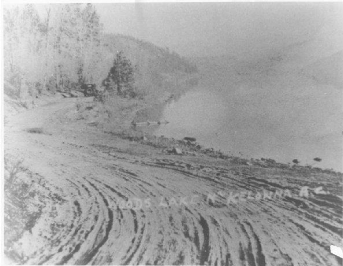
2008.000.092 Old road on west side of Woods Lake