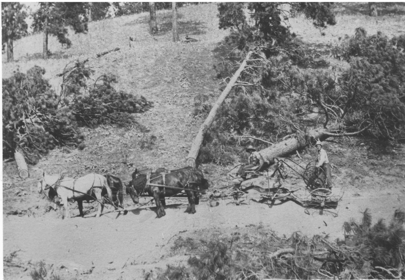
2007.019.006 Road Building