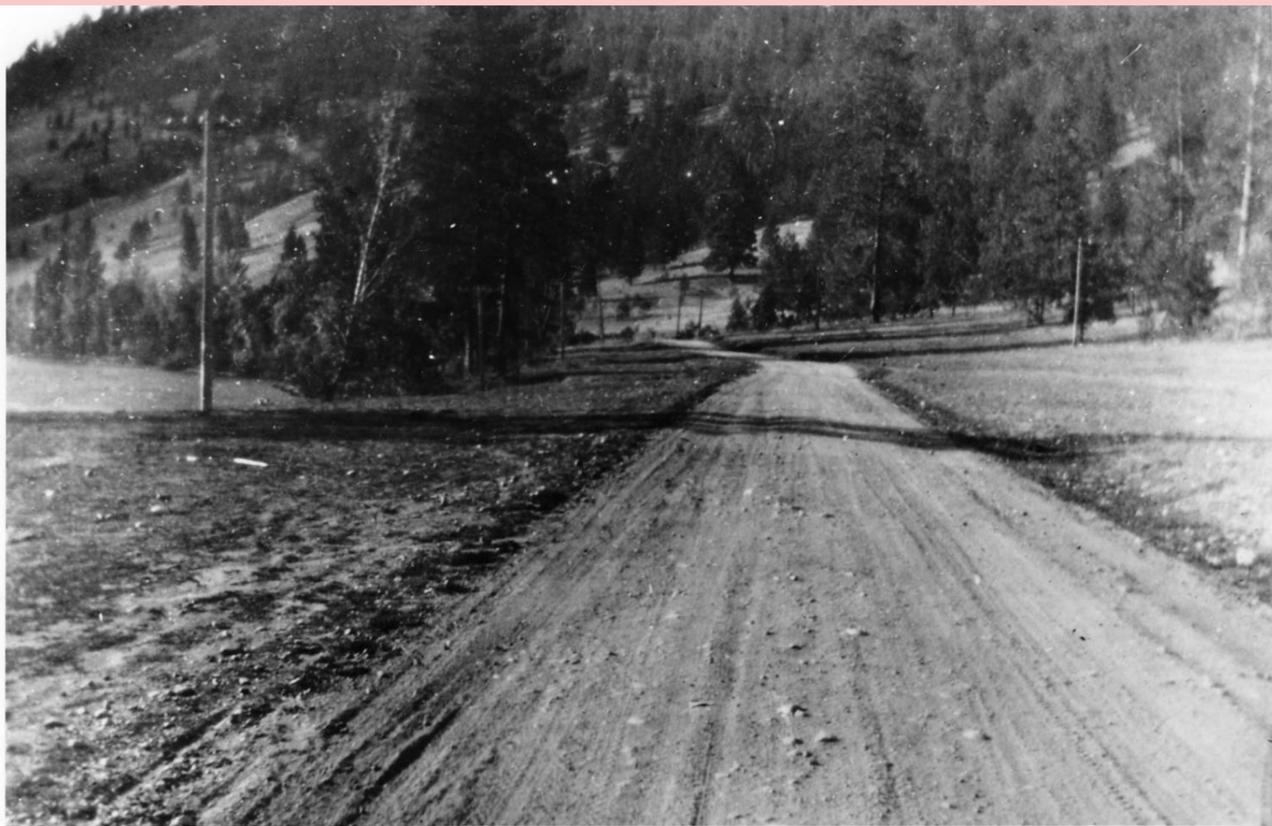
2005.000.015 Vernon Kelowna Road near N. end of Duck Lake