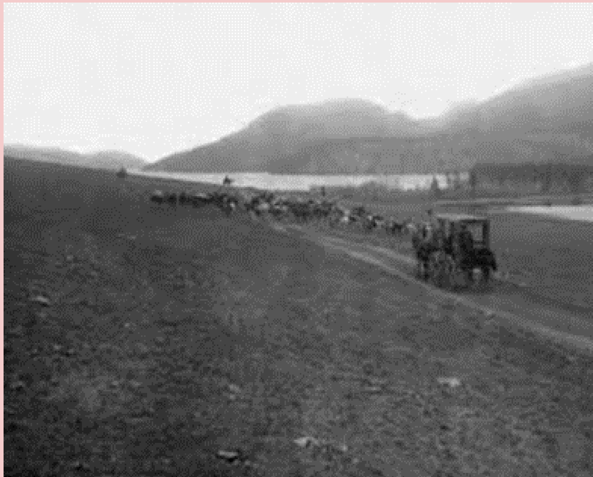
The Vernon to Okanagan Mission Stagecoach Road in 1890