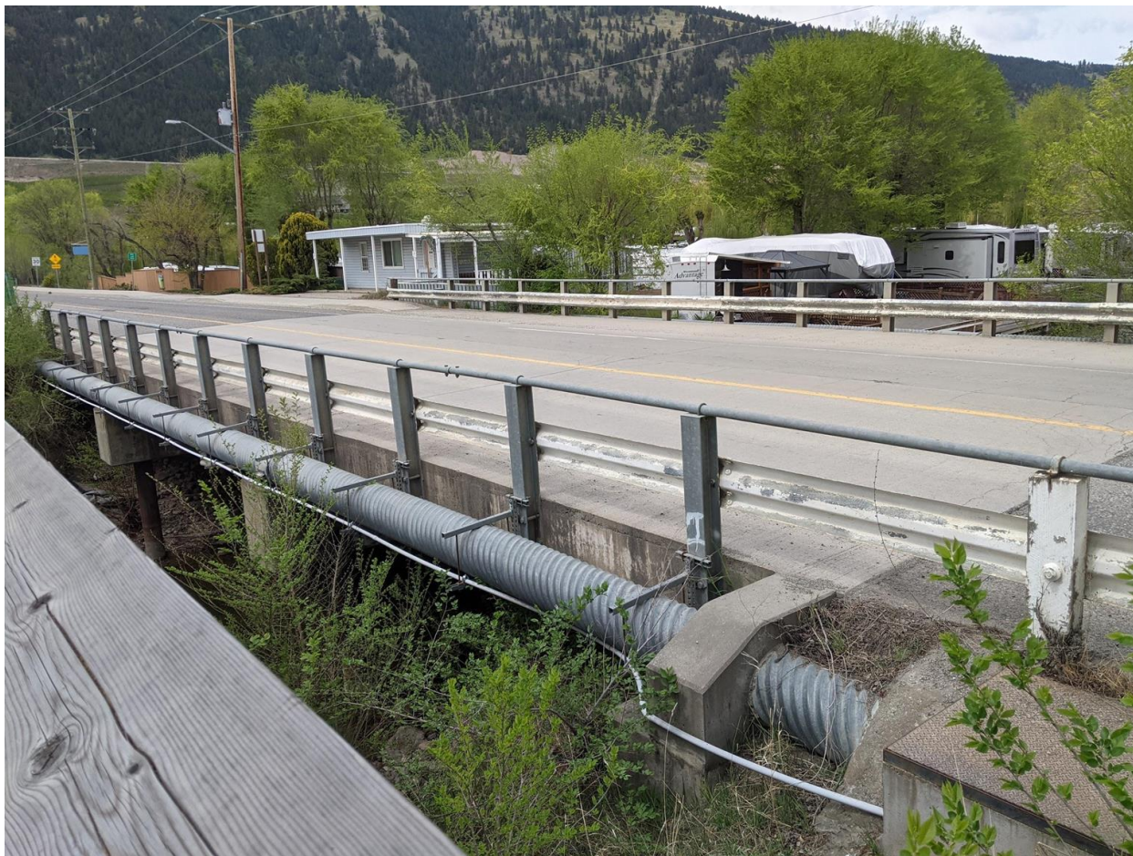
Oyama, bridge built over the canal, as it is today