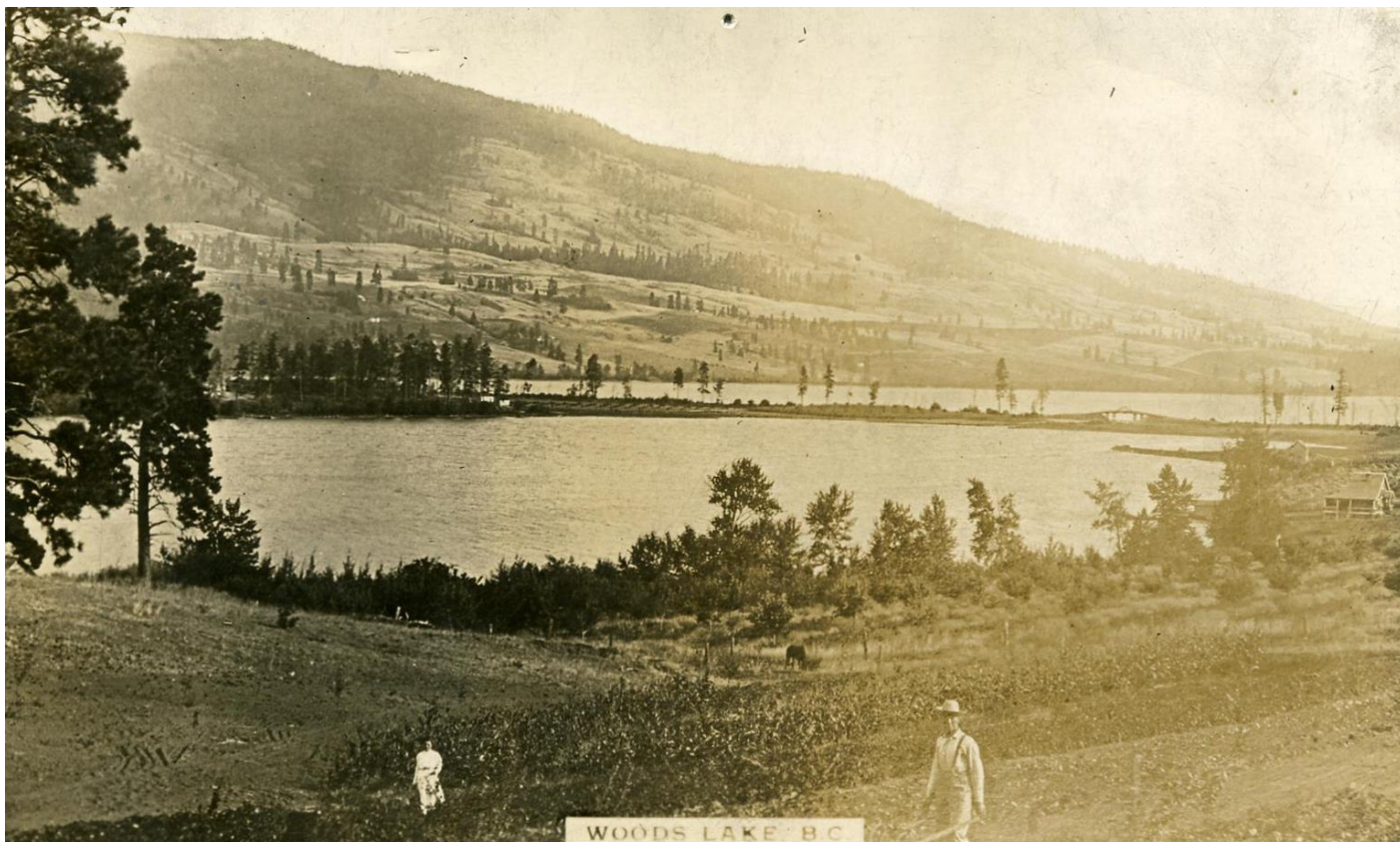
Kalamalka and Woods Lake 1900-1910 1999.000.025