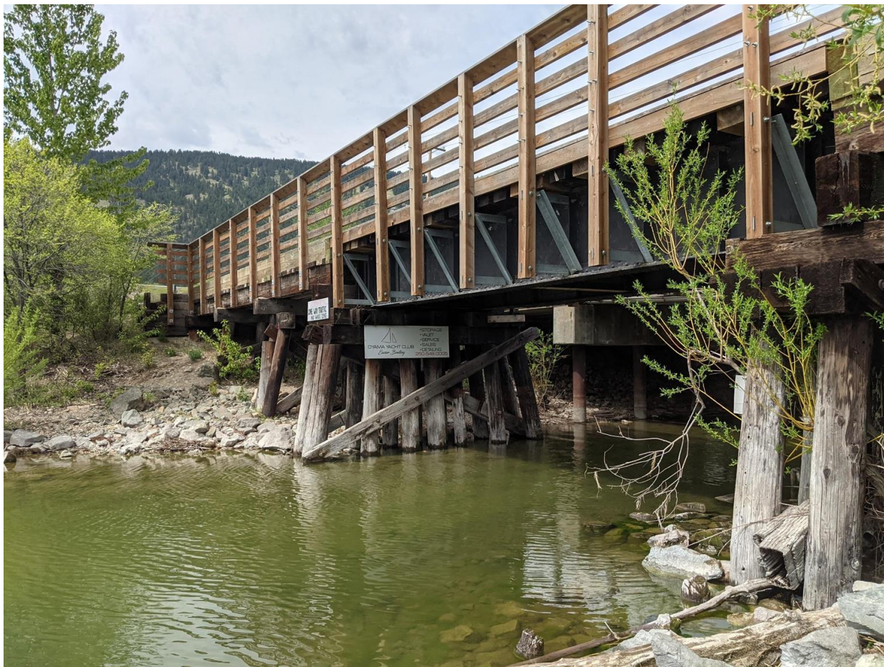
Oyama, bridge built over the canal, as it is today