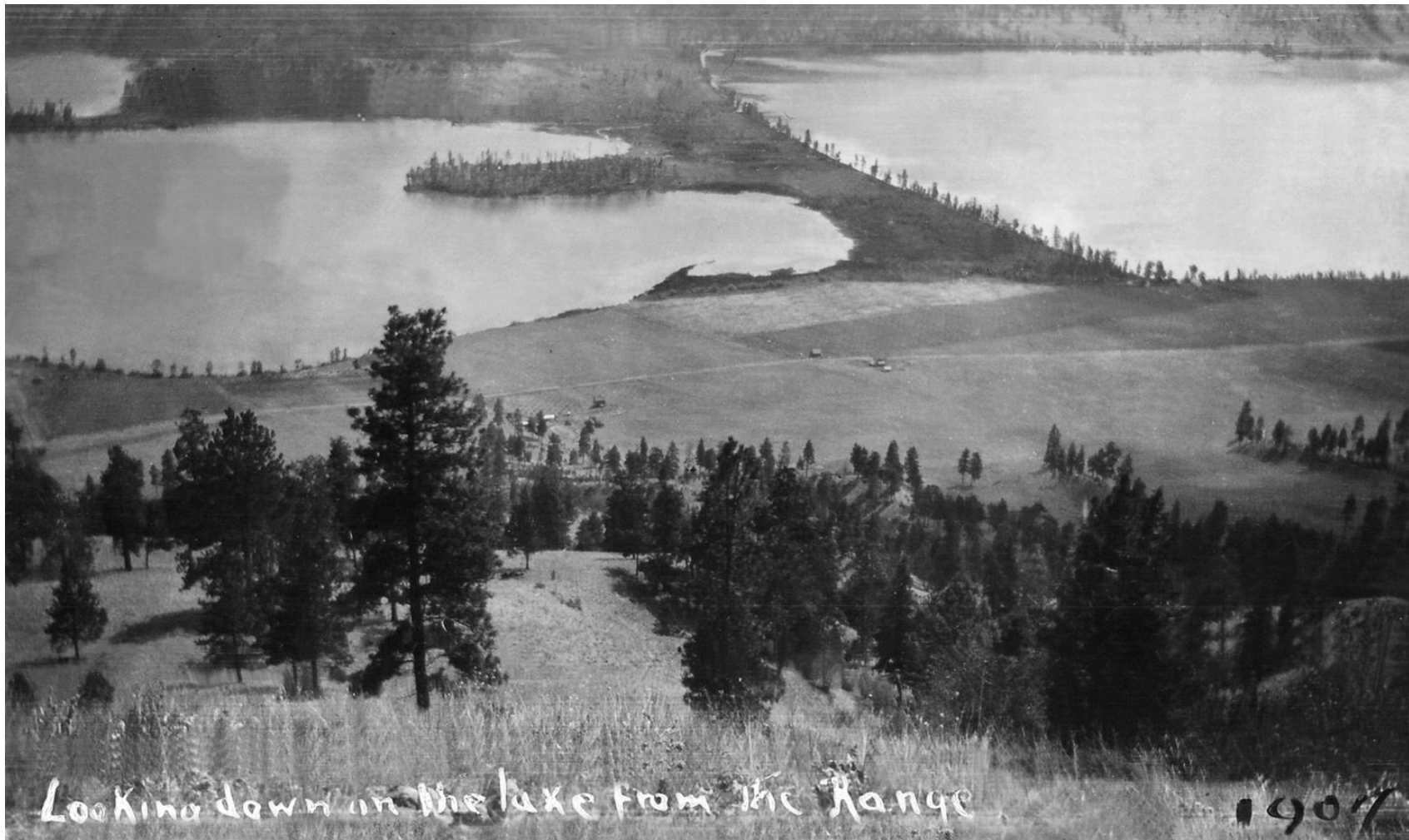
Looking down on the lake from the Range