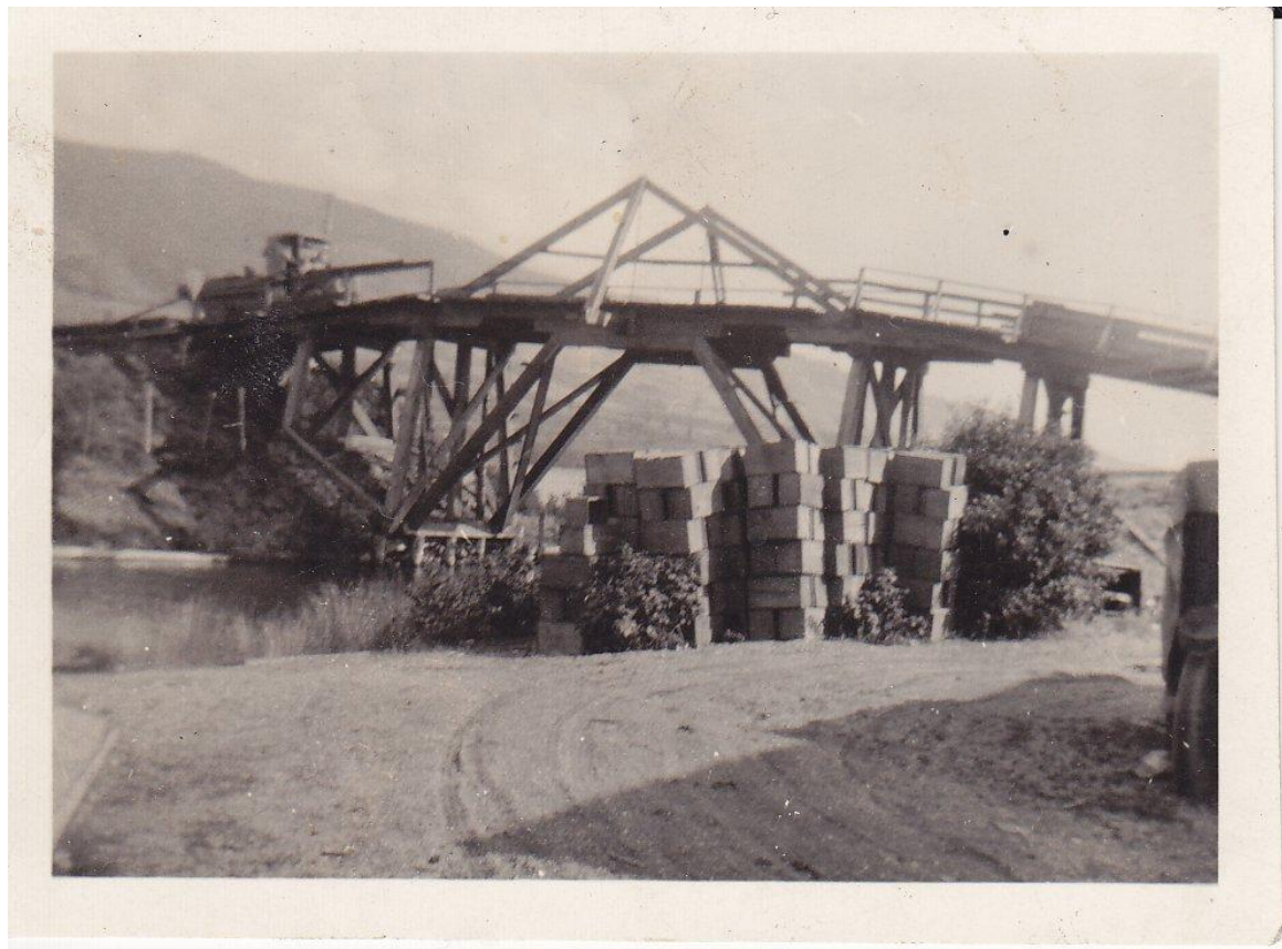
Oyama, bridge built over the canal