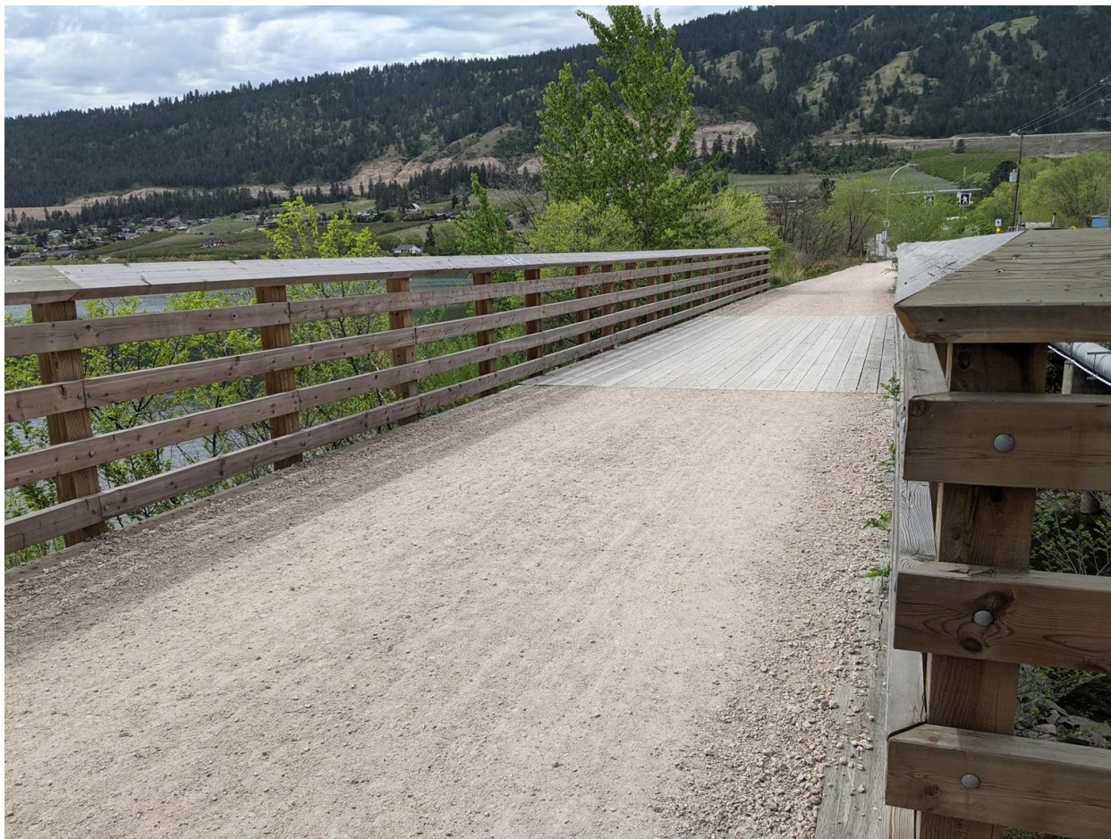
Oyama, bridge built over the canal, as it is today