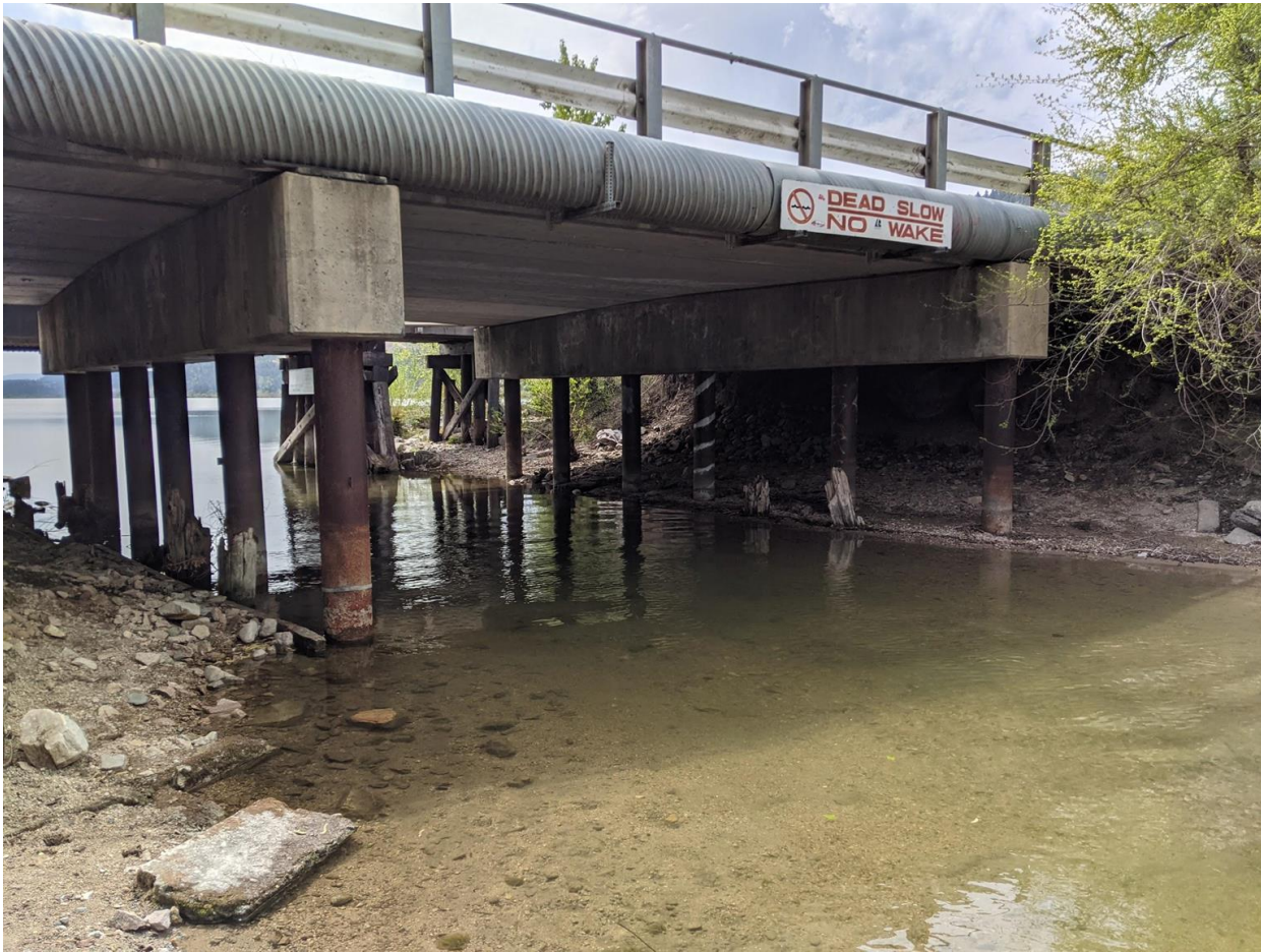
Oyama, bridge built over the canal, as it is today