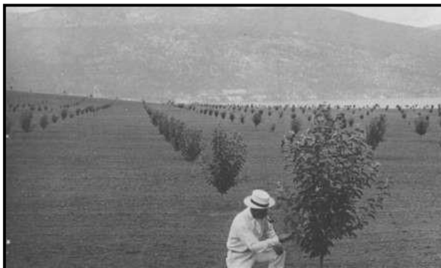
Rainbow Ranche Orchard, 1910