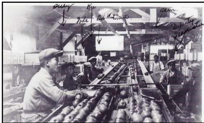
Sorting apples at the Rainbow Ranche packinghouse, 1920