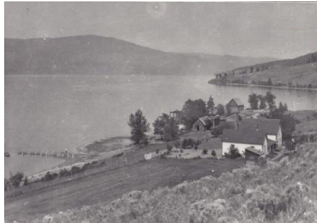
Rainbow Ranche House, 1910 (LCMA)

Compare the original photograph with your model. Develop a keen eye for detail.