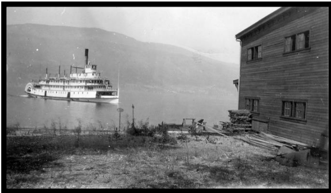
S.S. Sicamous off of Okanagan Centre